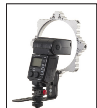
Octa PLUS Set Up